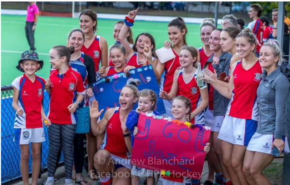
Some photos of this year's Premiership teams and their supporters