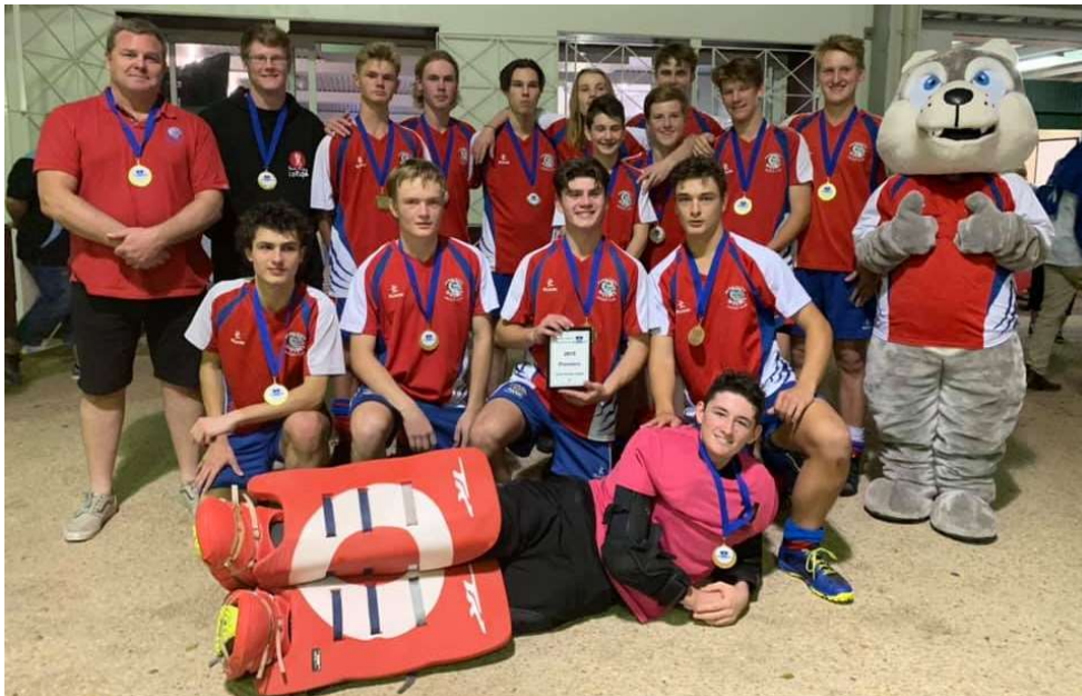
BHA J1 Premiers

We would like to acknowledge the boys who, by age, have played their last game of junior's proudly for Kedron Wavell Services Hockey Club. Thanks for your commitment to the development of our junior boys' section and we look forward to watching you enjoy your hockey full-time in the senior ranks.