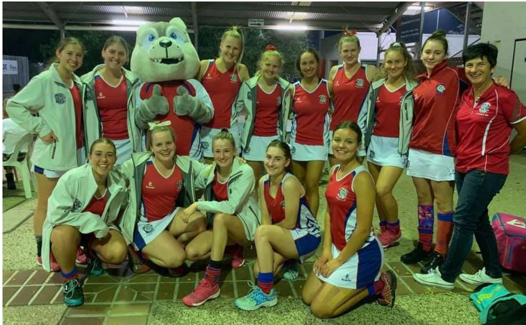
BWA JT1 Premiers